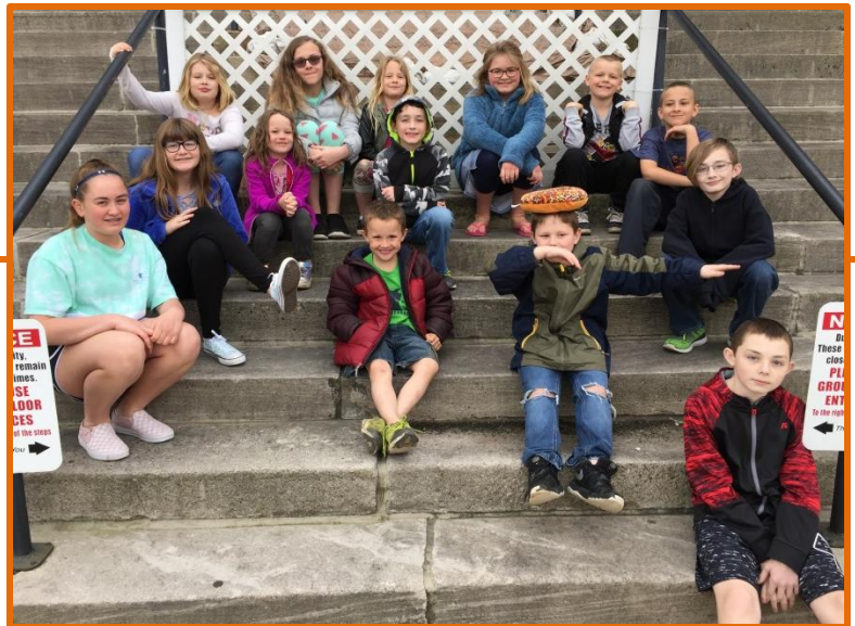
Movin' Up Prayer Walk April 2019 Courthouse Steps